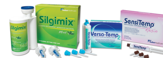
TEMPORARY CROWN AND BRIDGE MATERIALS